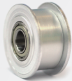
Single bearing+Retaining ring