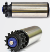
Double tooth row 2B