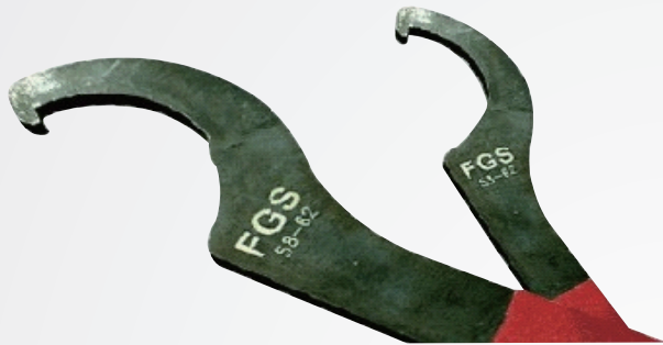
Material : Steel (blackened)