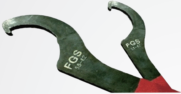
Material : Steel (blackened)