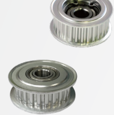
Two side bearing