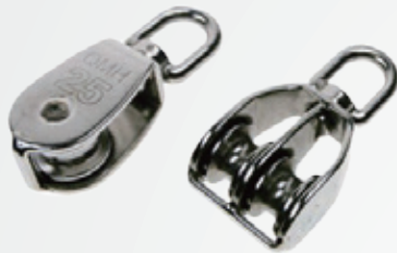
Single wheel = G